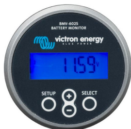
BMV 602S Black

(for all BMV models) Displays all information on a computer and loads charge/discharge data in an Excel file for graphical display.