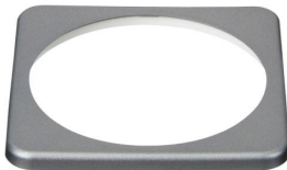
BMV bezel square