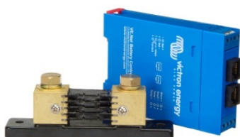
VE.Net Battery Controller

No prescaler needed. Note: RJ45 connectors are galvanically isolated from Controller and shunt.